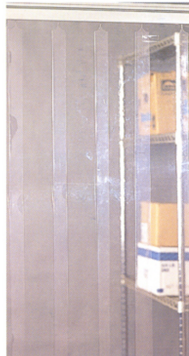
Plastic Strip Door Curtain