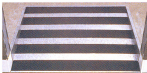
Non-Skid Abrasive Strips