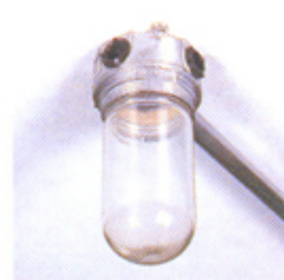
Incandescent Light Fixture