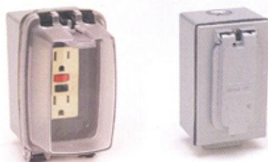
Weatherproof Switch Plate Cover