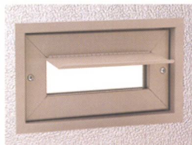
Security Door Window