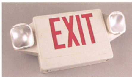
Emergency Exit Sign / Light