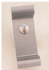
Door Cylinder Lock