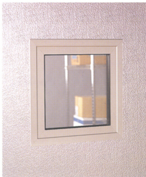
Door Observation Window