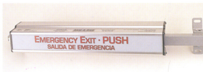
Door Exit Device / Panic Bar