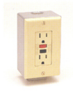
120V GFC Duplex Receptacle